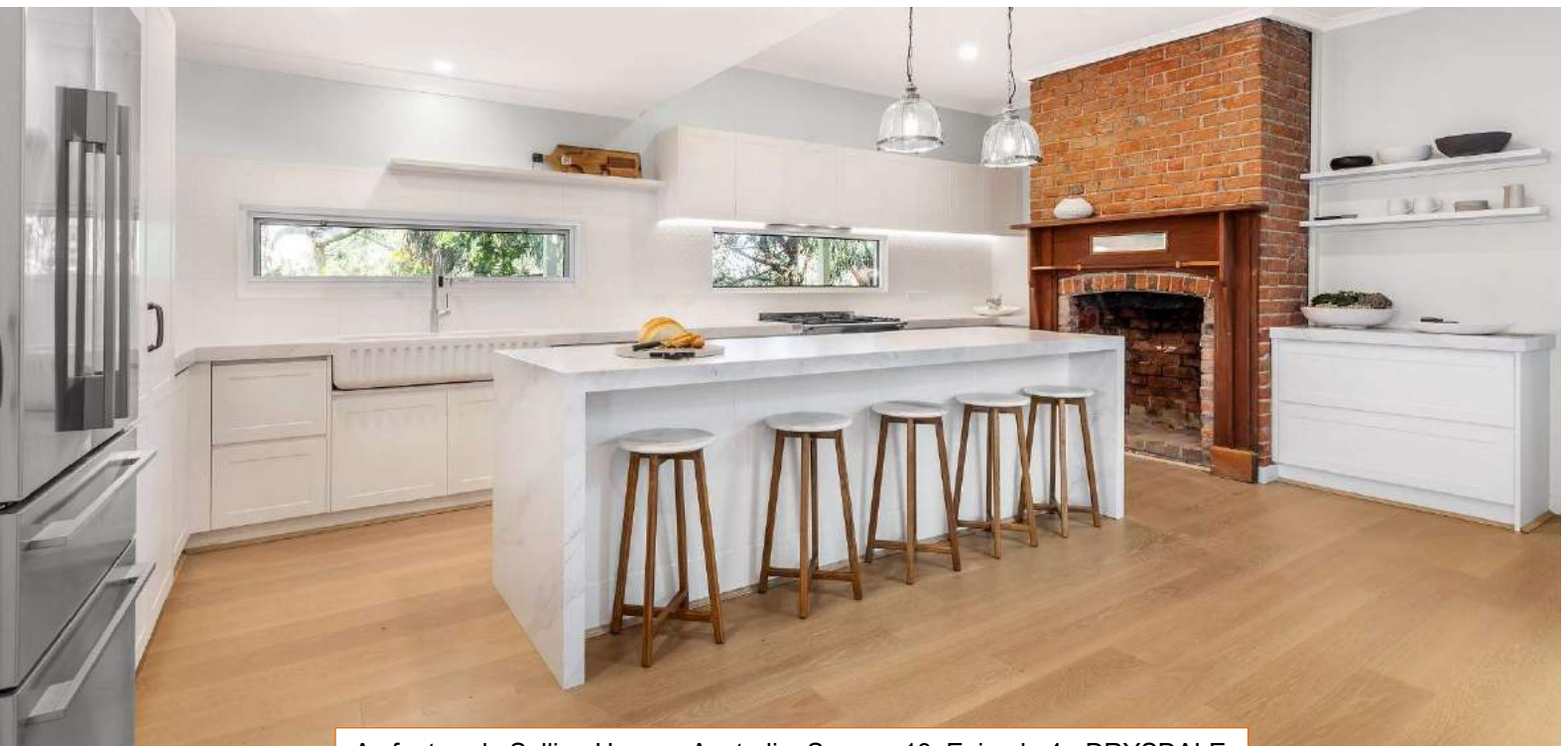
As featured : Selling Houses Australia: Season 13, Episode 4 - DRYSDALE

If you have your own trades or can manage any part yourself, you end up saving. BUT, if you don't want the hassle, let us do it all for you.